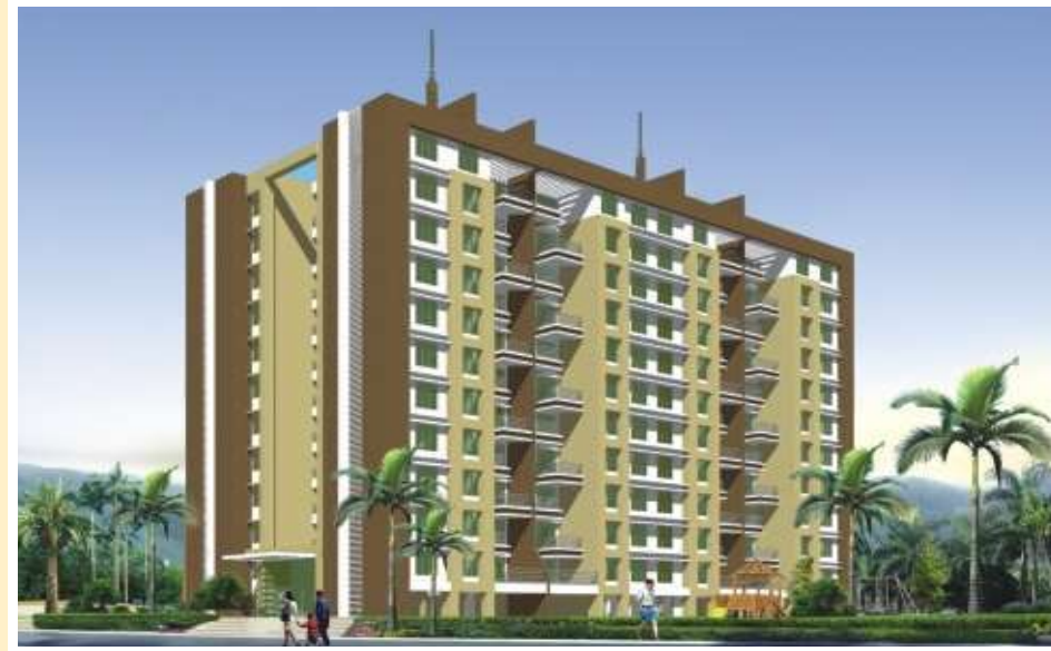
Park Xpress 2 & 3 BHK Apartments at Baner