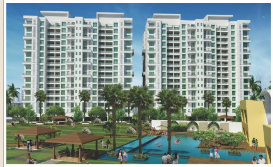
Park Titanium - Phase II 3 BHK Luxury Condominiums at Wakad