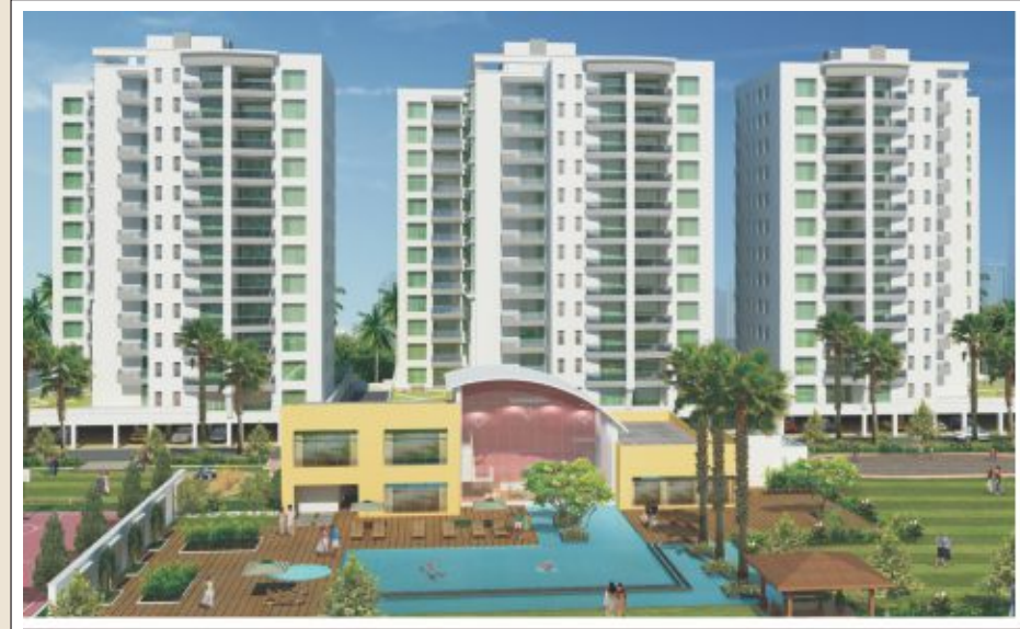
Park Titanium - Phase I 3, 4 BHK Luxury Condominiums at Wakad