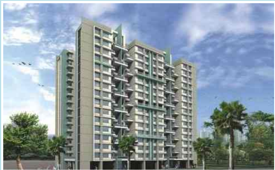
Park Turquoise 2, 2.5 & 3 BHK Luxury home at Wakad