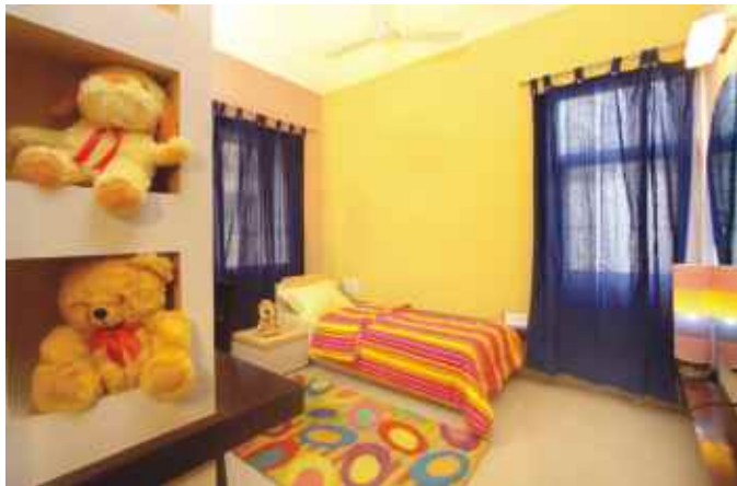
Children bedroom- 11' X 13' 7"