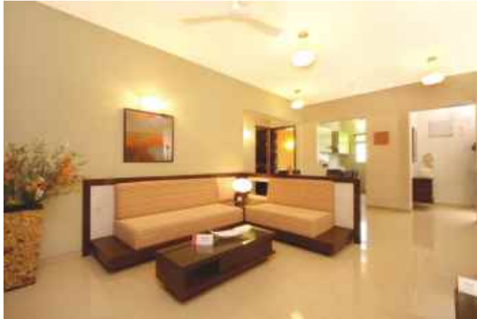
Living- 11'10" X 12' 10"