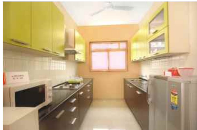
Kitchen- 7' 10" X 10' 3"