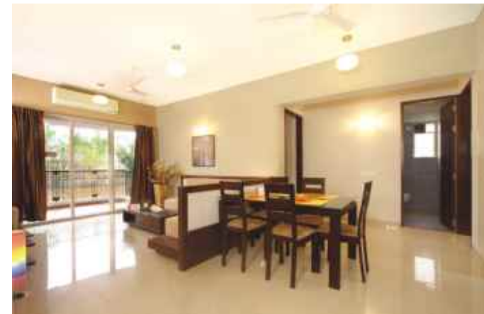
Dining- 15' 9" X 9' 4"