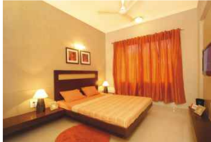
Master bedroom - 11'4" X 14' 1"