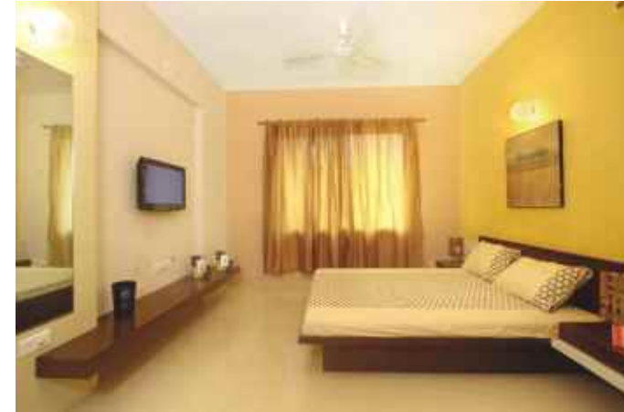
Guest bedroom- 11'5" X 10' 3"